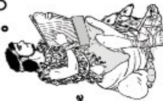
David, the Psalmist

The heavens declare the glory of God; the skies proclaim the work of his hands. Psalm 19:1